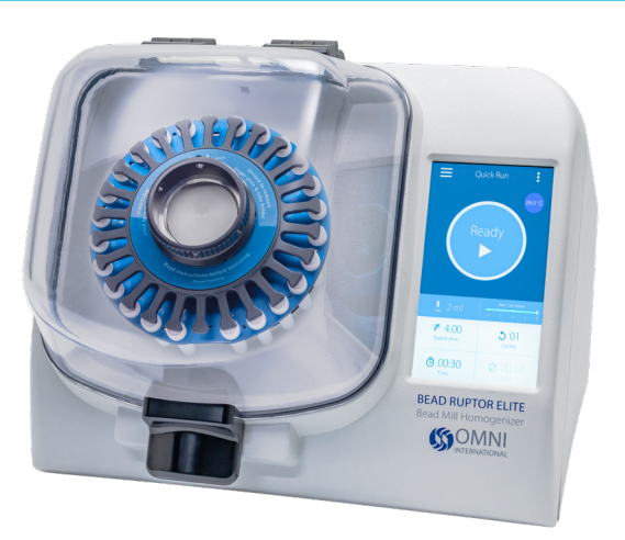
Bead Ruptor Elite<sup>™</sup> Bead Mill Homogenizer (PN 19-040E)