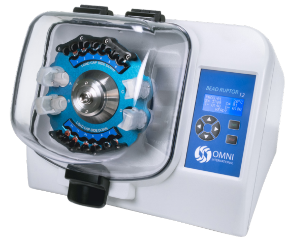
Bead Ruptor 12